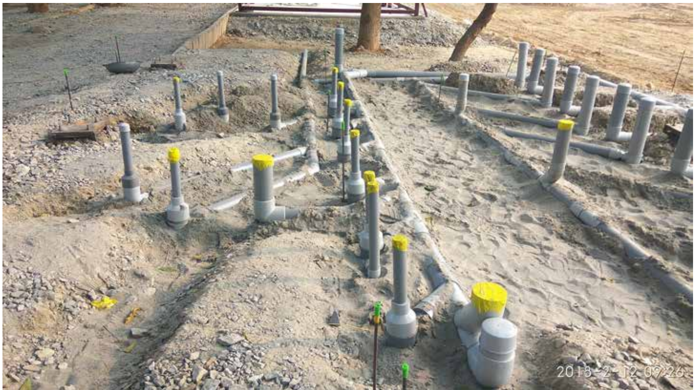
Tremix flooring , Plumbing Work