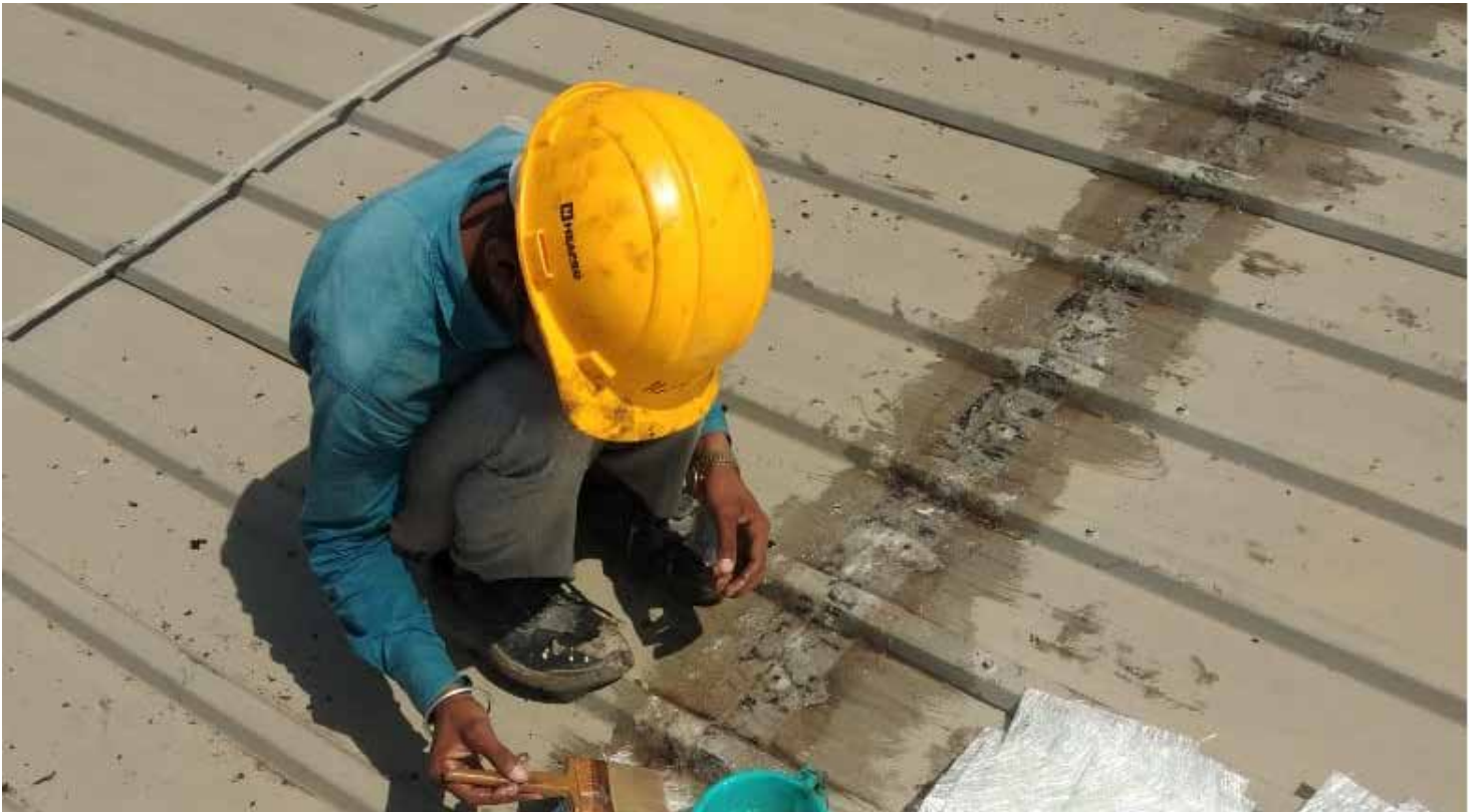
Roof Repair & Water proofing